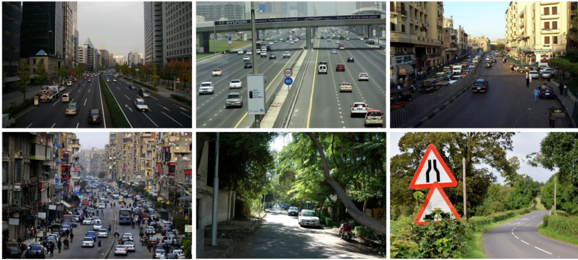
Fig. 5. Representation of areas with more complex or underdeveloped road networks