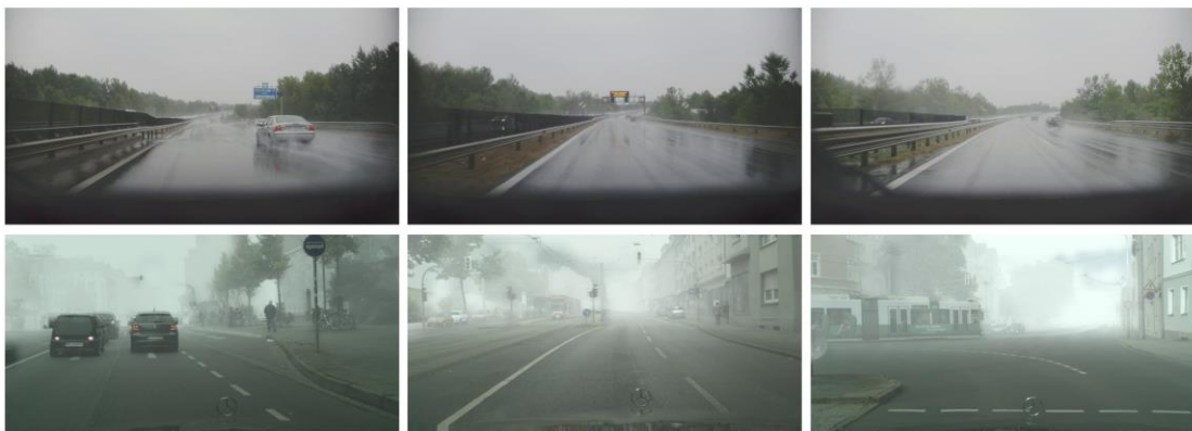
Fig. 4. Examples of adverse weather. From top to bottom: images with rainy weather [78] and images with foggy weather [161].

traffic signs in the image, Min et al. [144] combined the semantic scene understanding and structural traffic sign location for TSR. They designed a lightweight RefineNet to segment objects from the scene to obtain the information regarding the spatial positional at pixel level. Subsequently, a scene structure model which is based on the constraints of spatial positional relationships between traffic signs and other objects is built to establish the trusted search regions. Experimental results demonstrated that the proposed method could alleviate the mis-recognition of small traffic sign in straight road and curvy road scenes. While for complex scenes such as intersections, it still has ineffective recognition.