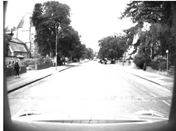
Fig. 3. Example image with sun glare. The image is from the RobotCar data set [163].

In 2016, Zhu et al. [66] collected a large-scale traffic sign data set from Tencent Street View panoramas, named TT100K. The TT100K data set has 100000 images containing 30000 traffic sign instances. Based on the TT100K data set, they trained two CNNs for TSR. One year later, Luo et al. [140] proposed a TSR system to recognize both symbol-based and text-based signs in video sequences. They first use MESRs to extract traffic sign regions of interest (ROIs) from images. Then, a multi-task CNN is trained to refine and classify the ROIs. Lee and Kim [141] designed a CNN to simultaneously detect the position and boundary of traffic signs.