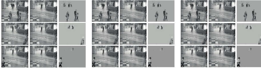
Figure 3: Robust PCA representation of several frames from the surveillance sequence obtained using the algorithm in Lin et al. (2009) (left group), Algorithm 1 (middle group), and a five layer neural network encoder (right group). Columns in each group are, left-to-right: the reconstructed frame \mathbf{Us} + \mathbf{o} , its low-rank approximation \mathbf{Us} (background), and the sparse outlier \mathbf{o} (foreground). Each row corresponds to a different frame.