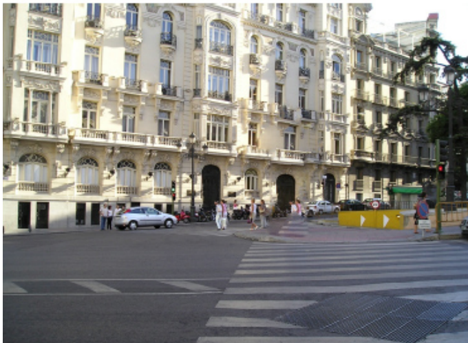
Fig. 3. More results on Image inpainting