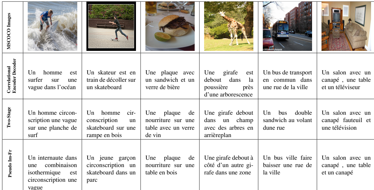
Table 5: Example captions generated by the three methods on a sample set of MSCOCO test images

1. Two Stage : Here we use a Show & Tell model (Vinyals et al., 2015b) trained using D_1 to generate an English caption for the image. We then translate this caption into French using IBM’s translation system as described above.