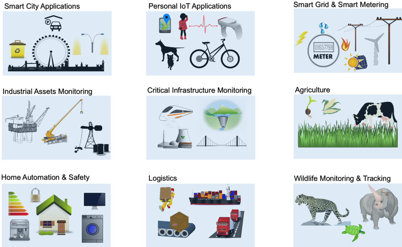
Fig. 1. Applications of LPWA technologies across different sectors