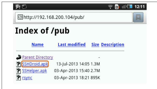
Fig. 1. Screenshot of browsing the public directory.

From the running SSHDroid-app on the Android target-device it will be easy to see which dynamic IP address is leased from the access-point's DHCP-server. Take note of this IP, because it is the IP that will be needed to connect to from the investigating computer.