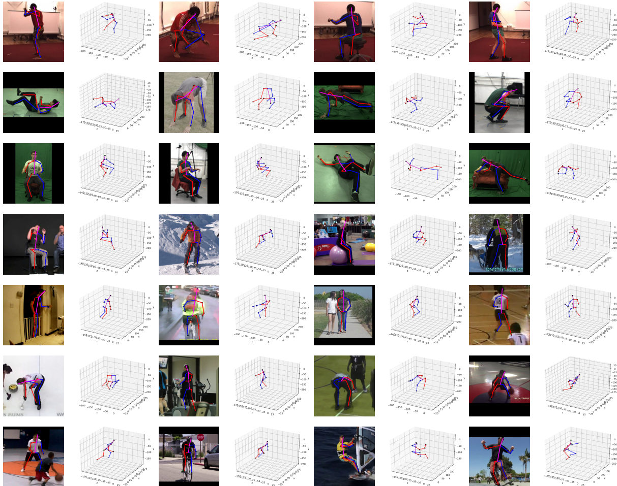
Table 5. Qualitative results from different datasets. We show the 2D pose on the original image and 3D pose from a novel view. First line: Human 3.6M dataset; Second and third lines: MPI-INF-3DHP dataset; Fourth to seventh lines: MPII dataset.