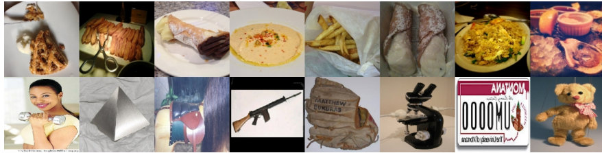
Fig. 2. Example of images contained in the FCD Dataset. Top row shows food images from Food101 and bottom row shows non-food images from Caltech256.

RagusaDS The dataset was constructed from three datasets with images acquired in different conditions: UNICT-FD889 [21] and Flickr-Food [8] for food images and Flickr-NonFood [8] for images other than meals. UNICT-FD889 is a dataset containing 3,583 images of meals of 889 different dishes acquired from multiple perspectives with the same device in real-world scenarios, where images of meals are acquired from a top view avoiding the presence of other objects. Another part of these dataset is composed by images downloaded from Flickr and manually labelled as being food or non-food images. These datasets, which are called Flickr-Food and Flickr-NonFood, contain 4,805 images of food and 8,005 non-food images, respectively. Differently to UNICT-FD889, these datasets contain images less restricted, and specifically for Flickr-Food the images can contain objects different to the food and can be taken from different points of view. In total, the dataset contains 8,388 images of food and 8,005 of non-food (see Fig.3). To evaluate our approach, we used for training the 80% and for validation the 20% of all images from UNICT-FD889 together with 3,583 images contained in the first half of Flickr-NonFood and for testing all images from Flickr-Food together with 4,422 images contained in the second half of Flickr-NonFood.