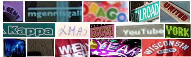
Figure 3: Challenging samples of scene text from COCO-text which are correctly recognized (with C.R.W. upper) by AdaDNNs: “GEMS”, “mgennisgal”, “RGAO”, “RAILROAD”, “UNITED”, “Kappa”, “XMAS”, “ZOOM”, “YouTube”, “YORK”, “WALK”, “WPRD”, “WHEN”, “YEAR”, and “WISCONSIN”.

in ICDAR 2017. So, the comparative results of AdaDNNs, AdaDNNs Pruning and the baseline DNNs are only on the validation set; they are 58.08%, 66.07%, and 66.27%, respectively. Some scene text recognition samples for COCO-text are shown in Fig. 3.