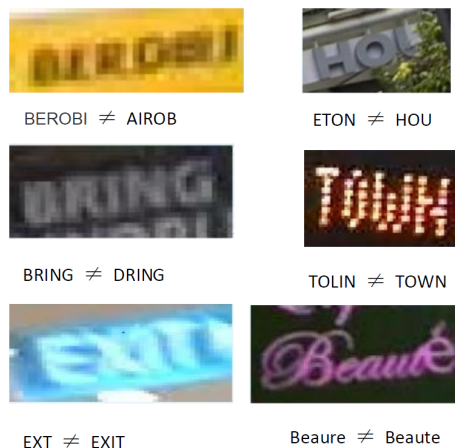
Figure 1: Some challenging examples (from 2015 ICDAR Robust Reading Competition Challenge 4 dataset) of scene text images which are incorrectly recognized by the baseline DNNs (see related descriptions in Experiments). The captions show the recognized text (left) versus the ground truth (right): additional characters, wrong characters and missing characters in target words.

However, there are a variety of grand challenges for scene text recognition (see samples in Fig. 1), even with recent deep neural networks (DNNs), where additional characters will be probably identified for text distortions and complex backgrounds, some characters are wrongly recognized for changing illuminations and complex noises, and characters are sometimes missed for low resolutions and diverse distortions.