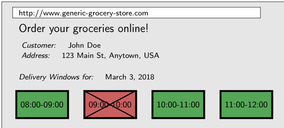
Figure 1: Illustration of a generic example website of an AHD service for grocery online shopping. Based on the customer’s address, the system determines the availability of the predefined delivery time windows. Non-available delivery time windows, e.g., 09:00-10:00, are crossed out.

Optionally, for reasons of profit maximizing, some available time windows can be hidden from the customer or be offered at different rates. However, we do not consider any kind of slot pricing in this work. For related and recent work on pricing in the context of AHD systems we refer the reader to [11, 12, 18].