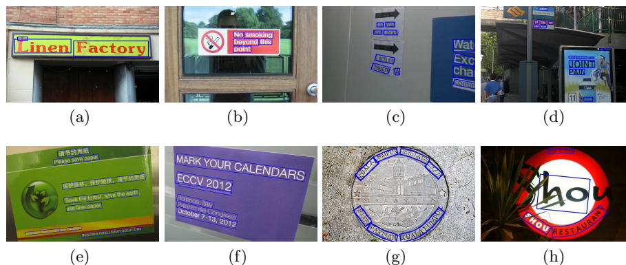
Fig. 4. Qualitative evaluation of the proposed CENet. Dark blue bounding boundaries show our text detection results on the datasets. Fig. (a,b) are from ICDAR13; fig. (c,d) are from ICDAR15; fig. (e,f) are from MSRA-TD500; and fig. (g,h) are from Total-Text dataset. Zoom in to see better.

Tab. 2 lists the results on ICDAR13 dataset of various state-of-art methods. Our model presents a competitive performance on this scenario. The demonstrated that the proposed CENet is capable of learning horizontal text line. Note that WordSup adopted the horizontal nature of text directly when grouping characters into text lines, and the data-driven CENet could achieve a similar performance without utilizing that strong prior. s, d are set to 0.4 and 0.45 in this dataset.