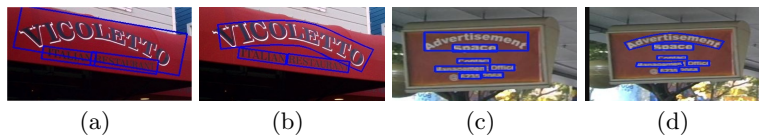
Fig. 1. Examples of curved text from Total-Text and ICDAR15. Detected texts are labeled with quadrangle bounding box in (a) and (c), and with polygon by our proposed method in (b) and (d). Note that the image is cropped for better presentation. The dark blue lines represent the detected text boundaries.

However, when text appears in the wild, it often suffers from severe deformation and distortion. Even worse, some text are curved as designed. In such scenario, this strong prior does not hold. Fig. 1 shows curved text with quadrangle bounding boxes and curved tight bounding boundaries. It can be easily observed the quadrangle bounding box inevitably contains extra background, making it more ambiguous than curved polygon boundaries.