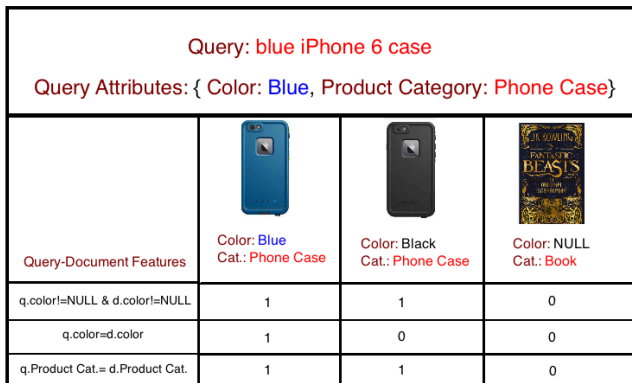
Figure 1: Features in an E-com query

A key aspect of E-Com search is the presence of a large number of product and query attributes, around which ranking features need to be constructed. Product attributes are properties of products such as Brand, Rating, Category etc. present in the catalog either manually provided by the merchant or automatically extracted from the description. Query attributes are defined as the attributes expected by the query in the products. Macdonald et. al. investigated which types of query attributes are useful to improve learned models [22]. These query features are typically obtained by either parsing the query directly, analyzing search log data, or training an attribute predictor for the query. For example a query like blue iPhone 6 case expects products with attribute “Color: Blue” and “Category: Phone Cases”. We refer to these as query attributes. These are then matched with document attributes to generate query-document features. An example is shown in Figure 1.