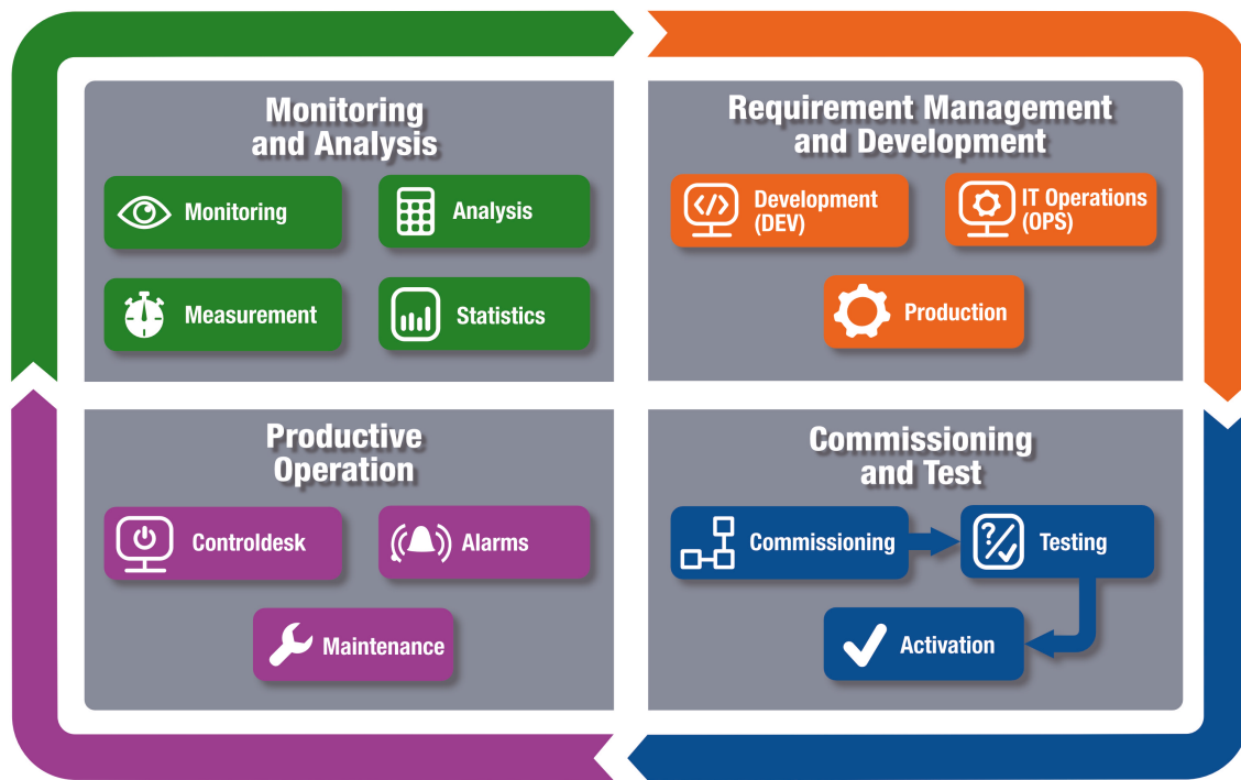
Fig. 1. The continuous adaptation and improvement process of Industrial DevOps

software replaces the old one in production, where it is monitored again.