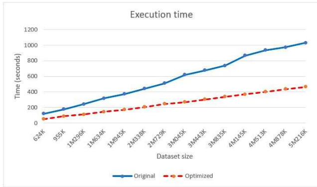
Fig. 2. Execution time of both algorithms versus subject fiber dataset size.