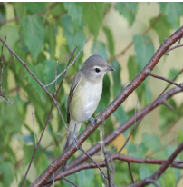
(a) The input