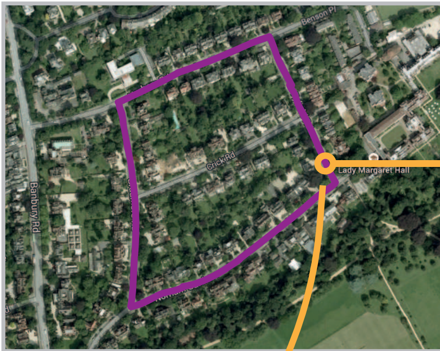
Local Expert Detector Model