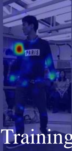
Training step: 0