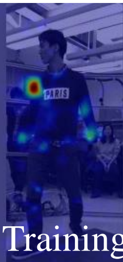
Training step: 0