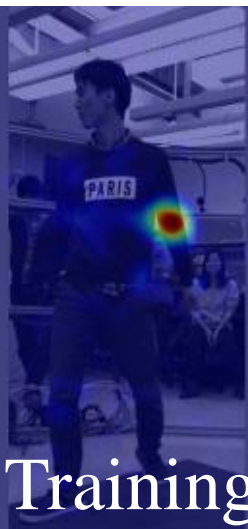
Training step: 4980