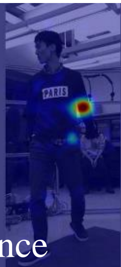
Geometric consistency via epipolar divergence