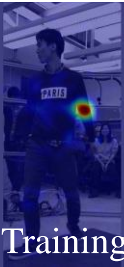
Training step: 4980