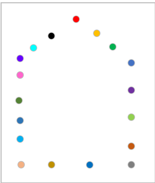
(a) 3D Point Cloud