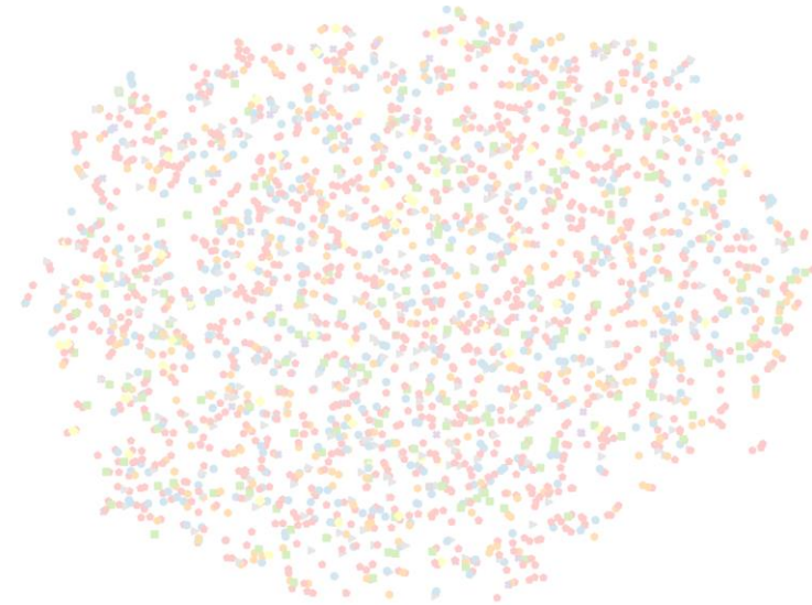
(c) The original distribution of the MELD dataset