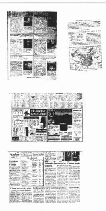
Figure 3: Documents used in the experiments.

A system which is based on this approach was developed. It was implemented in C and runs on SUN SPARCstations. Figure 3 shows some of the test documents. On a SPARC 10, the system takes 2 seconds to generate zone candidates from all sub-images and takes another 4 seconds to combine the candidates to form regions of the document. The system was tested on 250 images which contain both English and Japanese documents. Currently, the system achieves 95% accuracy rate in locating regions.