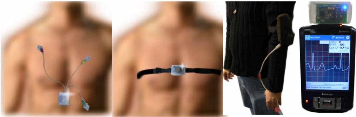
Fig. 3. (a) Wireless 3-lead ECG sensor, (b) ECG Strap, (c) SpO2 sensor, and the PDA base station.