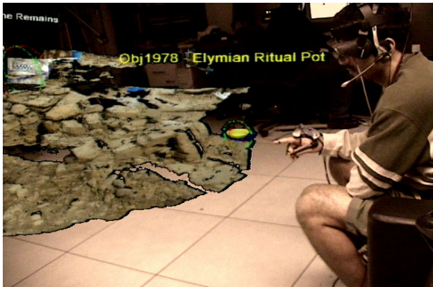
Figure 4. User's view of a section of the site in AR. The other user, 3D terrain model, and objects in this section are visible. Objects are represented either with a 3D model or with a picture if the model is not available.

We are developing hybrid interaction techniques for exploring our virtual and augmented environment. Users have a variety of means for interacting with the 3D environment, including combinations of gestures and speech, and four buttons attached to the glove. Since no modification of the environment is allowed, users' interaction is primarily focused on selection and inspection of objects, terrain, and multimedia data. Object selection is the most frequently used 3D interaction technique, and we provide several ways to accomplish it. The user can walk towards an object and grab it or point at it in the distance using our SenseShapes selection tools [20], as shown in Figure 4. Selection at a distance is prone to ambiguity, especially when many similar objects are near each other, and SenseShapes assist in their disambiguation.