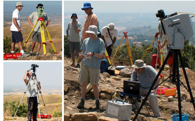
Figure 2. Research team members record exact 3D coordinates using a total station surveying instrument (upper left), capture video of an excavation using a digital camera (lower left), and scan a portion of the dig site using the Cyrax range scanner (right).

ologists envision using this space for both data interpretation after they have left the field, and for field planning and preparation for the next season. In addition, remote collaboration should be possible. For example, a pottery specialist could give her interpretation of a ceramic pot in situ to colleagues in a different physical location. These possibilities all suggest the potential advantages of applying AR/VR technology.