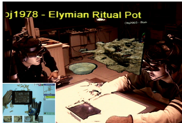
Figure 1. Two users collaborate in our system using the MERL DiamondTouch table. The virtual model of the pot is shown next to the table and the 3D terrain model is shown in the background.

Since an excavation is naturally a destructive (and often unreconstructable) process, our goal has been to capture and preserve the excavation process to allow users, ranging from interested novices to experienced archaeologists, to visualize it off-site at different points in time.