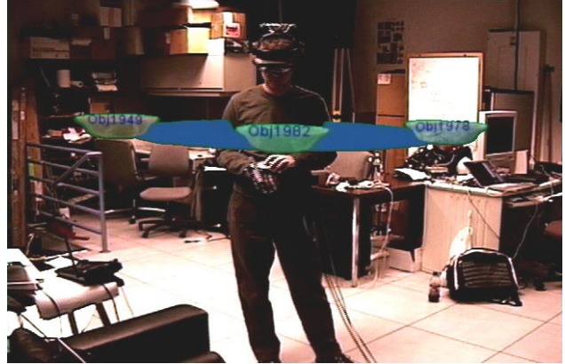
Figure 5. User inspecting objects in his "virtual pack."

SenseShapes are 3D selection volumes that represent the regions of interest and are attached to a tracked portion of the user's body (e.g., the head and hand, in our case). SenseShapes keep an event history of all the objects that intersect them and provide a way to query and obtain statistics on those objects. For example, it is possible to request "the objects that were in the picking cone during interval T " and SenseShapes will return the list of those objects, as well as useful statistics about them to facilitate correct multimodal interpretation. The statistics include information about time (how long was the object in the volume), stability (how many times did the object enter and leave the volume), distance (how far was the object from the user), and visibility (how much of the object was visible during that time frame). These statistics, combined with our gesture recognizer and speech recognizer, form our multimodal interaction framework. Our glove-based gesture recognizer currently supports three distinct gestures (point, grab, and thumbs-up).