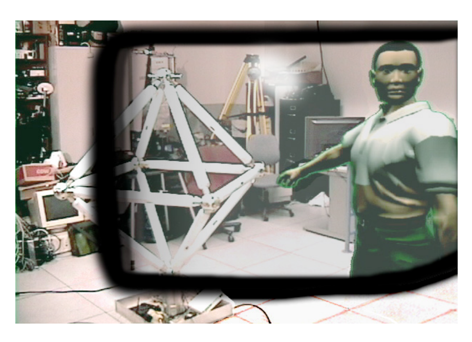
Figure 1: Our embodied agent Mirage is situated in the lab. Here we see how he appears to the user through the head-mounted glasses. (Image has been enhanced for clarity.)

Behind this work lies the conjecture that the mind can be modeled through the adequate combination of interacting, functional machines (modules). Of course, this is still debated in the research community and not all researchers are convinced of its merits. However, this claim is in its essence simply a combination of two less radical ones. First, that a divide-and-conquer methodology will be fruitful in studying the mind as a system. Since practically all scientific results since the Greek philosophers are based on this, it is hard to argue against it. In contrast to the search for unified theories in physics, we see the search for unified theories of cognition in the same way as articulated in Minsky's [1986] theory, that the mind is a multitude of interacting components, and his (perhaps whimsical but fundamental) claim that the brain is a hack.<sup>3</sup> In other words, we expect a working model of the mind to incorporate, and coherently address, what at first seems a tangle of control hierarchies and data paths. Which relates to another important theoretical stance: The need to model more than a single or a handful of the mind's mechanisms in isolation in order to understand the working mind. In a system of many modules with rich interaction, only a model incorporating a rich spectrum of (animal or human) mental functioning will give us a correct picture of the broad principles underlying intelligence.