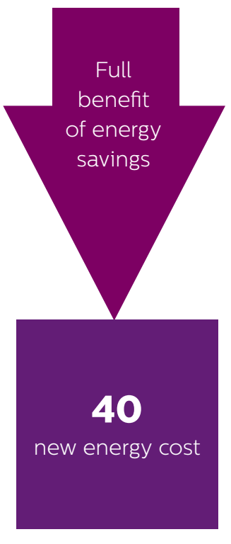
End of service contract