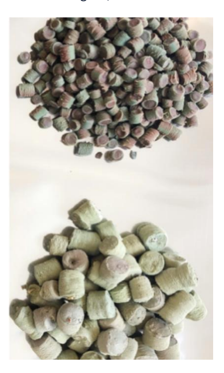
Figure 1: Arqlite Recycled Plastic Gravel