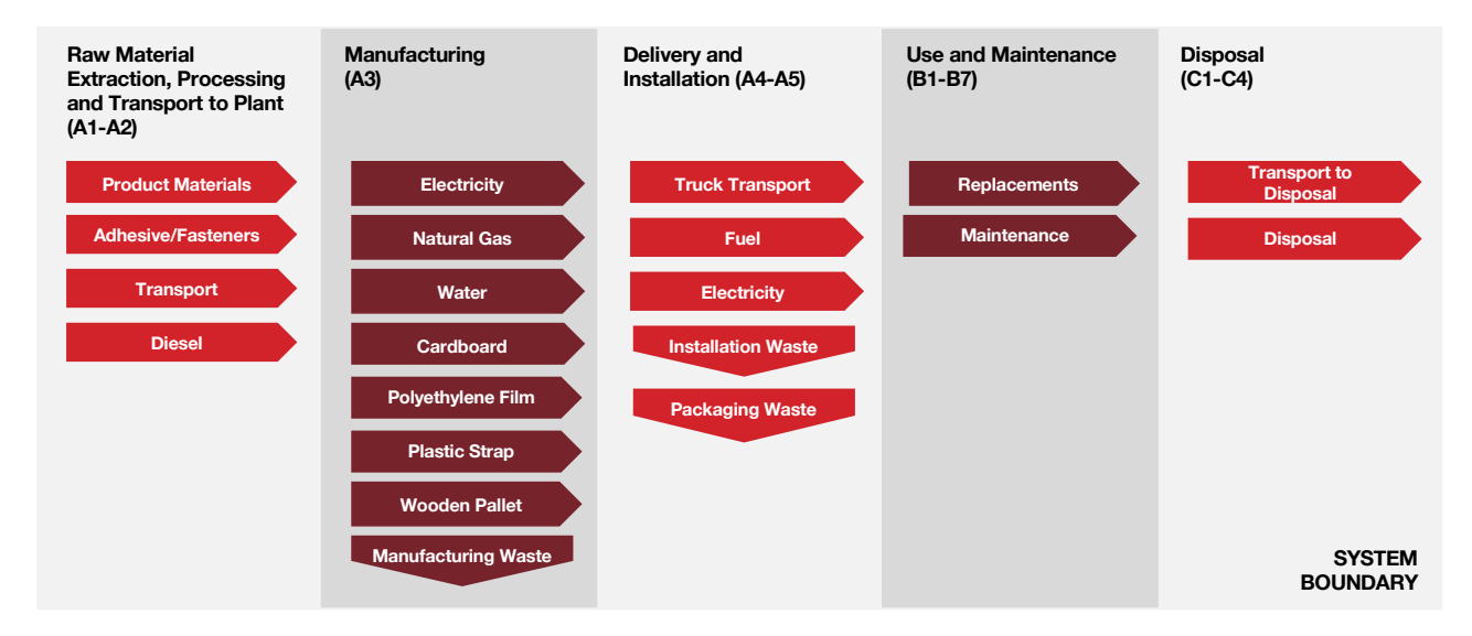
Figure 1: Flow Diagram

This LCA is a cradle-to-grave study, as represented by the flow diagram below. A summary of the life cycle stages can be found in Table 6. The reference service life (RSL) is outlined in the Reference Service Life & Estimated Building Service section of this EPD. The cut-off criteria are described in Cut-off Rules, and the allocation procedures are described in the Allocation section. No known flows are deliberately excluded from this EPD. Third party verified ISO 14040/44 secondary LCI data sets contribute more than 67% of total impacts in all impact categories required by the PCR.