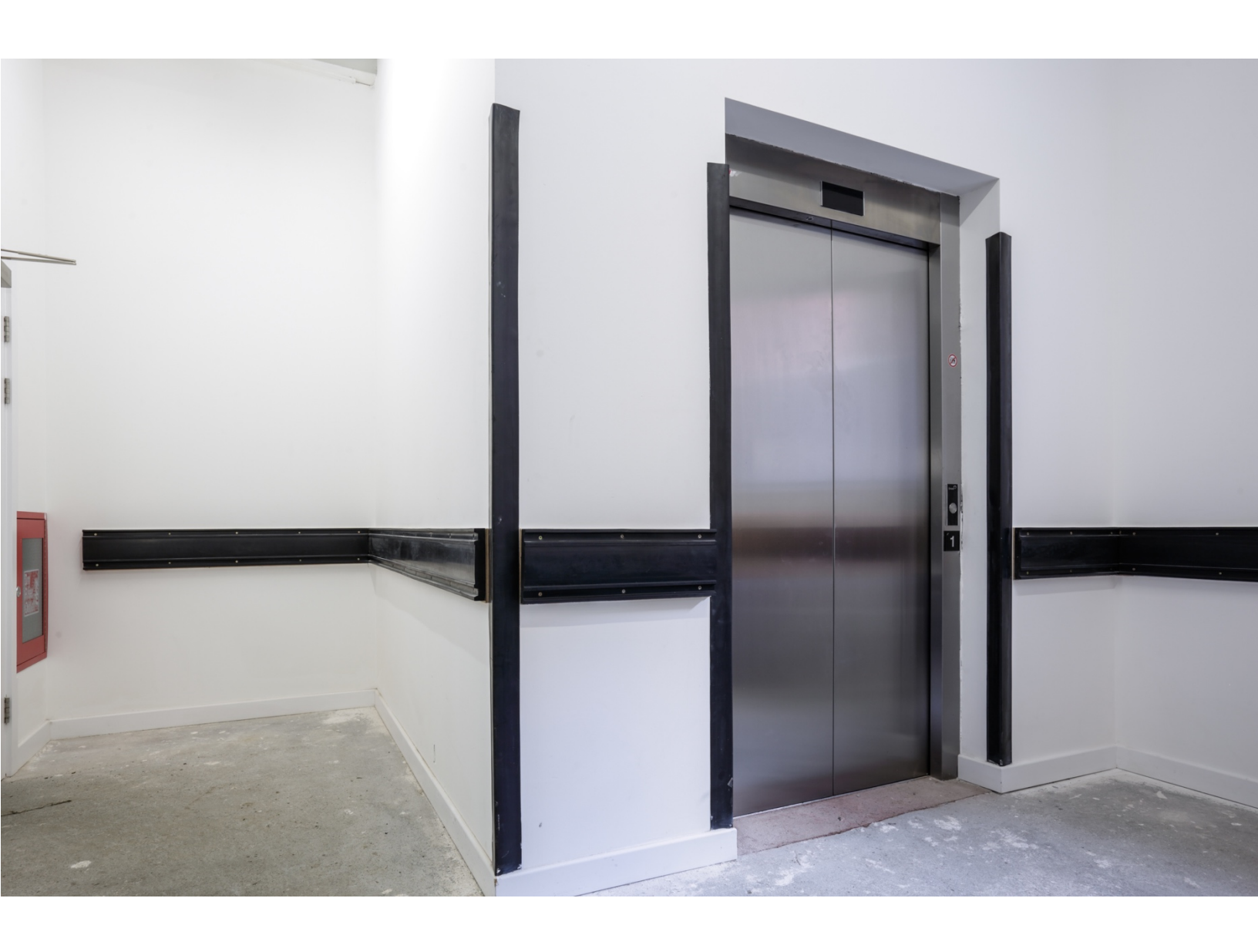
HB Crash Rails