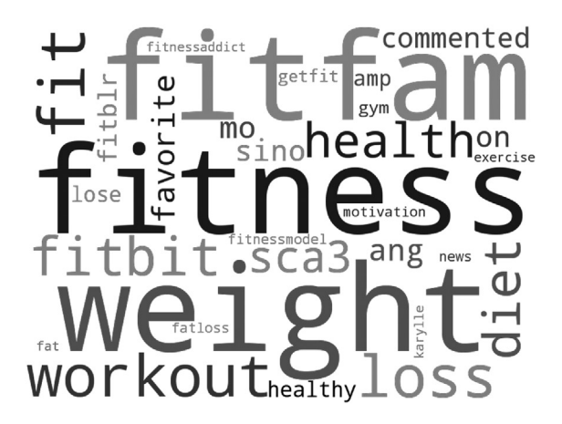
Fig. 3. Word clouds depicting unigrams for (a) thinspiration and (b) fitspiration tweets. Words are sized by frequency.

The large and unconnected nodes in the fitspiration network graph (Fig. 2) raise the possibility that these "users" represent brands or other forms of advertising. An automatic bot-detection system (Varol, Ferrara, Davis, Menczer, & Flammini, 2017) was used to compute bot scores (probability of being a "bot", i.e., non-human) for each account. The mean bot score for fitspiration-related accounts (M=0.39, SD=0.16) was significantly higher than for thinspiration-related accounts (M=0.31, SD=0.14), t(450)=8.00, p<.0001. This difference indicates that fitspiration accounts are on average 25% more likely than thinspiration accounts to be automated ("bots").