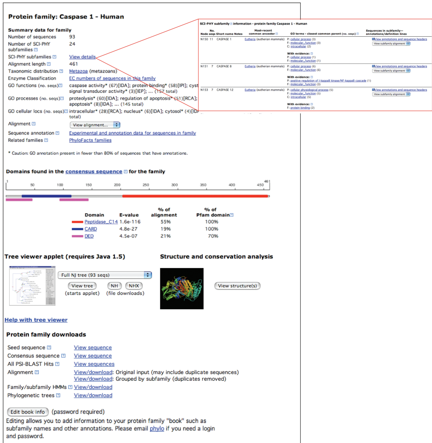
Figure 3. Result of PhyloBuilder run for human Caspase-1. PhyloBuilder takes an input protein sequence and outputs a web page containing a cluster of homologous proteins, multiple sequence alignment, neighbor-joining tree, predicted subfamilies, PFAM domains, transmembrane domains and signal peptides, and retrieval of Gene Ontology (GO) and Enzyme Classification (EC) data. Top: Summary data include the number of homologs retrieved, taxonomic distribution, EC numbers and GO annotations and evidence codes. SCI-PHY subfamilies can be viewed by clicking on the link labeled 'View details' (see inset at top right). The multiple sequence alignment can be viewed using JalView or hypertext. A spreadsheet with annotations for all sequences is available under 'Experimental and annotation data for sequences in family'. Middle: PFAM and transmembrane domain/signal peptide predictions are displayed. Neighbor-joining and SCI-PHY trees can be viewed using ATV. Homologous 3D structures can be viewed using Jmol; residues predicted to be critical using evolutionary conservation analysis are displayed on the structure. Catalytic Site Atlas data are included. Bottom: Various downloads are available, including a multiple sequence alignment for the family and individual subfamilies, a FASTA file for all PSI-BLAST hits, NJ tree and HMMs for the family and SCI-PHY subfamilies in HMMER and SAM formats. An 'Edit book info' button enables users to add descriptive labels to families and subfamilies (as shown in the inset at top right). See text for details.