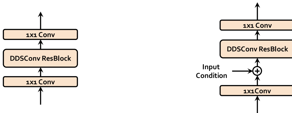
(a) Condition encoder in the stochastic duration predictor

All input conditions are processed through condition encoders, each consisting of two 1x1 convolutional layers and a DDSConv residual block. The posterior encoder and normalizing flow module have four coupling layers of neural spline flows. Each coupling layer first processes input and input conditions through a DDSConv block and produces 29-channel parameters that are used to construct 10 rational-quadratic functions. We set the hidden dimension of all coupling layers and condition encoders to 192. Figure 6a and 6b show the architecture of a condition encoder and a coupling layer used in the stochastic duration predictor.