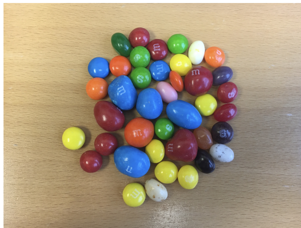
Figure 1. An example illustration from the unit depicting different types of candies, used to set up the problem and to engage learners in the process of feature engineering. In in-person contexts or virtual contexts where learners have candies available, they may interact with these objects directly. In other virtual contexts, the images and tables provided with the online materials may be used as stand-ins.