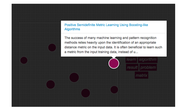
Figure 3: Visualizating title and abstract of document.

documents he is interested in. When the user clicks on the blue "Explain these results" button in the top right hand-side corner, a new tab opens (Figure 2). The balls represent the top 20 documents in sets of 10. Each set of 10 documents shows how dispersed or similar to each other these 10 documents are. The size of each ball indicates how "similar" a given document is to the original query. On the right side of each set of 10 documents a list of most common words in this set is presented. The user can keep on scrolling down to see more document sets. When the user hovers the mouse over one of the balls, the title and the abstract of the document it represents appear (Figure 3).