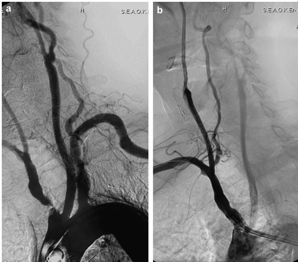
Figure 2 a and b. Successful PTA and stent (10 × 19 mm Genesis, Cordis Corp, Miami, Fla) deployment in the innominate artery of a 67-year-old symptomatic female patient with upper limb claudication. Follow-up duplex scan suggested no restenosis after 57 months follow-up. a, Angiography revealed subocclusion of the innominate artery. b, Control angiography after stent implantation.