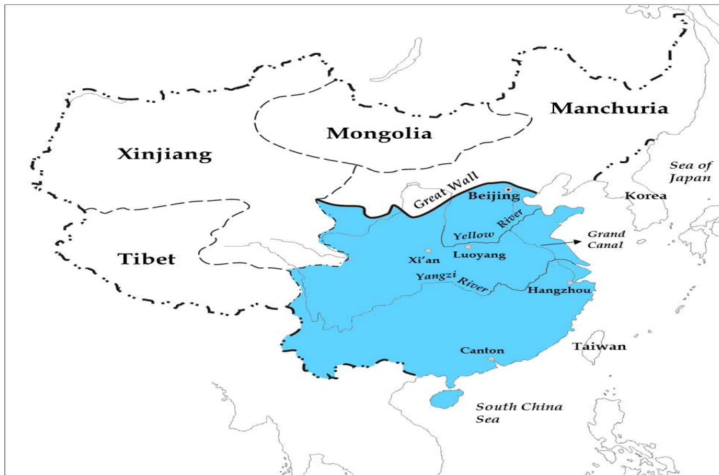
Map 1. Chinese Territory under Ming (shaded) and Qing

Zurndorfer, Harriet Thelma. 1989. Change and Continuity in Chinese Local History: The Development of Huizhou Prefecture, 800 to 1800 . Leiden ; New York: E.J. Brill.