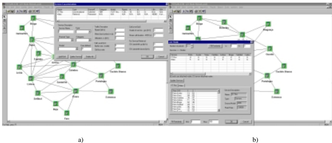
Figure 1 – Graphical user interface of PTPlan ATM.