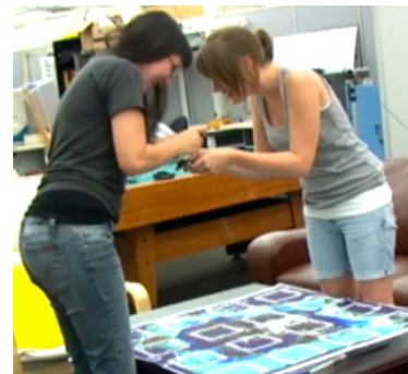
Figure 6. A player moving her device on top of her opponents' screen to block her view of the board.

The above cases are not an exhaustive list of the creative game strategies employed by the players. The richness of their interactions showed that the players rapidly adapted and immersed themselves in the gaming sphere by receiving and interpreting visual, aural, physical, and virtual cues in their own ways. The potential for such embodied and emergent interaction sets handheld AR gaming experiences apart from many other handheld games, console games and board games. When asked to compare their BragFish play experience with other game experiences, four groups of the players talked about how BragFish is similar to the Nintendo Wii (the game title of SmashBros [6] was mentioned three times), both of which involve more physical and social interaction than traditional games. Interestingly, one of the players described the Eye of Judgment experience as different from BragFish, although both of them are based on AR technology.