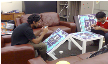
Figure 5. Players reconfiguring the game space to get a more comfortable position of play.

We originally felt that fishing as an activity lent itself to a handheld AR game implementation due to the fact that, even in real life, this is a slow paced social activity with competitive overtones. However, during the BragFish game play, we observed the game becoming fiercely competitive and attention-demanding under the lab setting. As put by P2, "(when the tracking is not working) It seemed to get in the way at the worst time. When I see a fish, I get excited and try to position the camera quickly – this caused tracking problem, though."