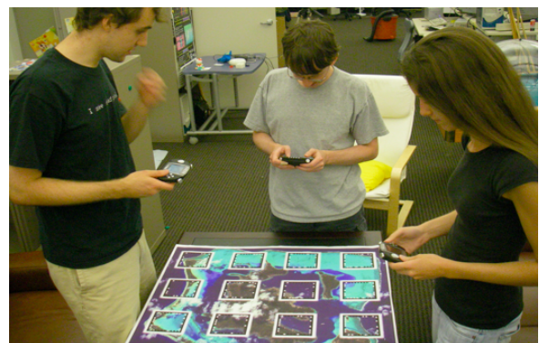
Figure 1. Three players playing BragFish

Currently, in multi-user handheld AR practice, predefined patterns of markers are used for tracking. They serve as a shared physical space overlaid with a virtual environment through private devices that have their own displays and sound. The fact that each player has his or her own device, which serves as a window to the shared space, means that (unlike multiplayer tabletop or console games) each person perceives both shared and private information. This gives game designers much more control over what information is available to each player, allowing them to create situations that require players to pay attention to each other and not just the computer screen. We are particularly interested in learning how this experience is different from other multiplayer handheld gaming experiences, in which players tend to sit together, yet focus on their own devices, according to previous research [32].