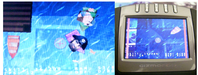
Figure 3. (left). The icons are rendered on top of the boat to show the role of the player; (right). The red vertical bars indicate that tracking is not currently working.

BragFish is played on a physical game board with Gizmondos, which are handheld game devices with a camera mounted on the back. The board is covered with a regular grid of fiducials. The core game mechanic involves the players navigating their boats around a lake, casting their lines, reeling them back in, dumping fish onto the dock and ramming other players' boats to steal their fish. The players look at the game board through the device screen and control their boats using the device's buttons. Casting of the hook and lure (referred to from here on simply as "the bobber") is controlled by pointing the crosshair that is fixed in the center of the screen at the target location on the map. The virtual boats and fish, water and effects are rendered on top of live video streaming in through each player's camera. There is a radius around the boat where the player can see fish. A boat has three kinds of skills: ramming, defending and fishing. All of the skills increase when corresponding action is performed, and decay at a fixed rate. Ramming skill decides the probability of stealing a fish from the rammed boat. When the ramming skill goes up to a certain level, the player will become a pirate, with an icon shown on top of the boat. When fishing skill goes up, the range of fish that can be seen from a boat is increased, and a fisherman icon is rendered on the boat after fishing skill reaches a threshold value (see Fig. 3. left).