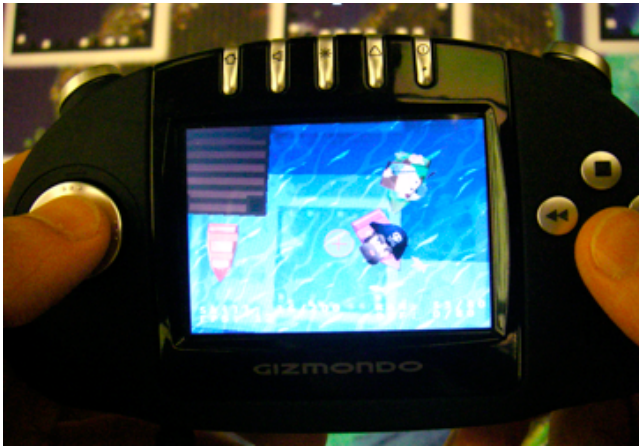
Figure 2. BragFish: Interface and handheld gaming device

In this paper, we present our work designing, implementing and evaluating a multiplayer handheld AR game prototype, BragFish (see Figure 2). This experience leverages hybrid features from both handheld video games and board games, and aims to foster social play among friends and families (see Figure 1). In addition to trying to create a fun game, we use BragFish as a research tool to explore the relationship between the distinctive characteristics of handheld AR technology, specific aspects of the game’s design, and the resulting social play. We are particularly interested in identifying what factors affect the emergent social interaction triggered by handheld AR interfaces.