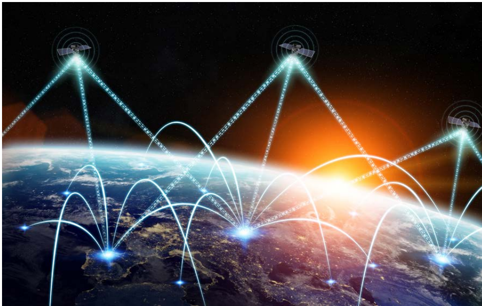
Figure 9 Global seamless coverage — three-dimensional connections

broadband access anytime and anywhere, particularly for remote areas, airplanes, UAVs, vehicles, and ships. It can also enable wide-area IoT access in areas not covered by terrestrial networks, ensuring emergency communications, crop monitoring, endangered animal monitoring in uninhabited areas, as well as collection of information on marine buoys and ocean containers. In addition, centimeter-level positioning will enable high-precision navigation and precise agriculture. With high-precision surface imaging of the earth, services such as emergency rescue and traffic dispatching can also be implemented.