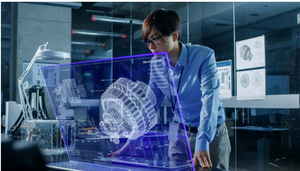
Figure 3 Holographic communications — immersive premium experience

With the continuous development of wireless networks, high-resolution rendering, and terminal displays, holographic technology will enable 3D dynamic interaction among people, things, and surrounding environments through natural and lifelike visual restoration, greatly empowering future-oriented communications.