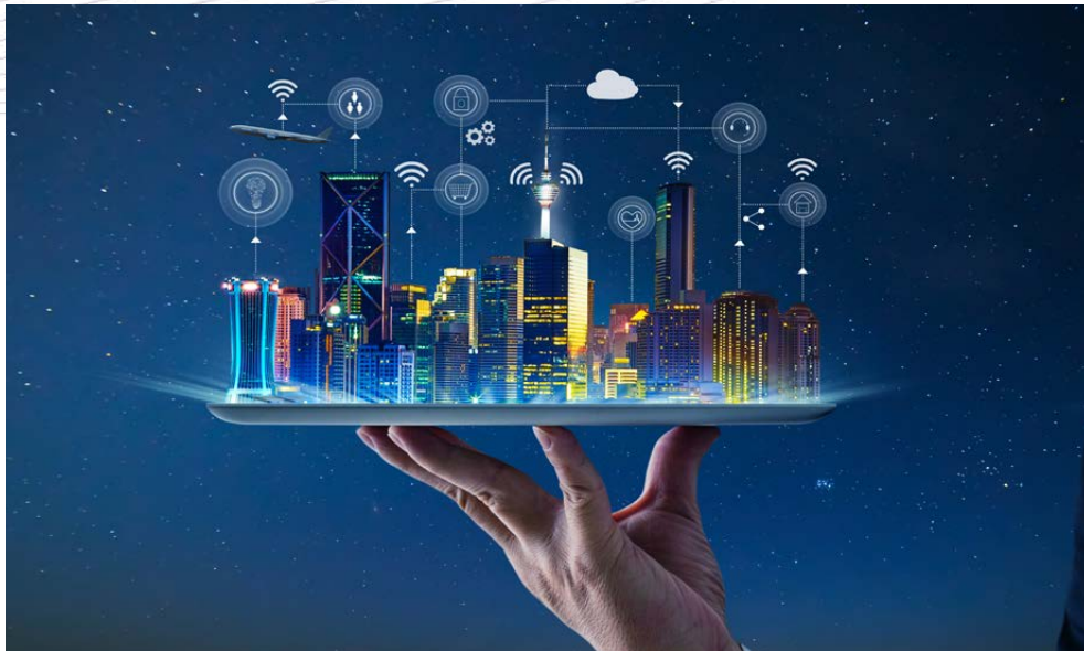
Figure 8 Digital twins — digital mirror of the physical world

factors and improve production as well as utilization of the land. In network O&M, networks can quickly adapt to complex and dynamic environments through physical and digital interaction, cognitive intelligence, and automatic O&M, bringing autonomy throughout the O&M lifecycle, from planning to construction, monitoring, optimization, and self-healing.