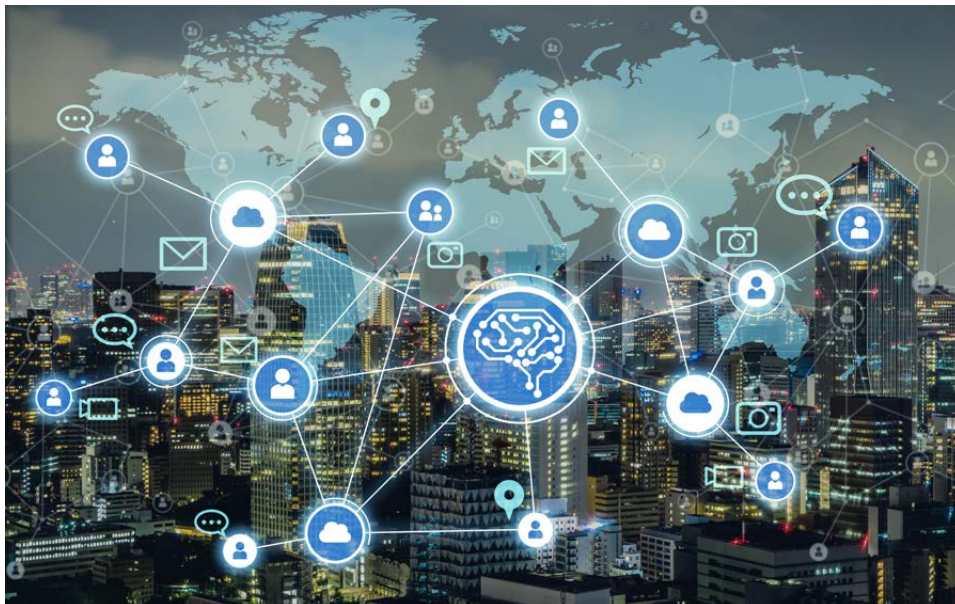
Figure 7 Proliferation of intelligence — ubiquitous smart core

By 2030, we will see more smart terminals, including smart personal and household devices, sensors in cities, unmanned vehicles, and smart robots. Unlike current smartphones, these new terminals will not only transmit data at high speeds, but also work with and learn from various smart devices. The number of devices connected through the 6G network is expected to reach trillions in the future. Through continuous learning, communication, cooperation, and competition, these devices can efficiently simulate and predict physical world