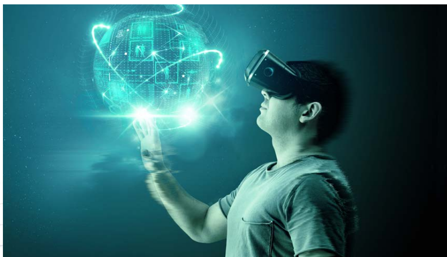
Figure 2 Immersive cloud XR — a broad virtual space

In 2030 and beyond, the immense improvement of networks and XR terminals