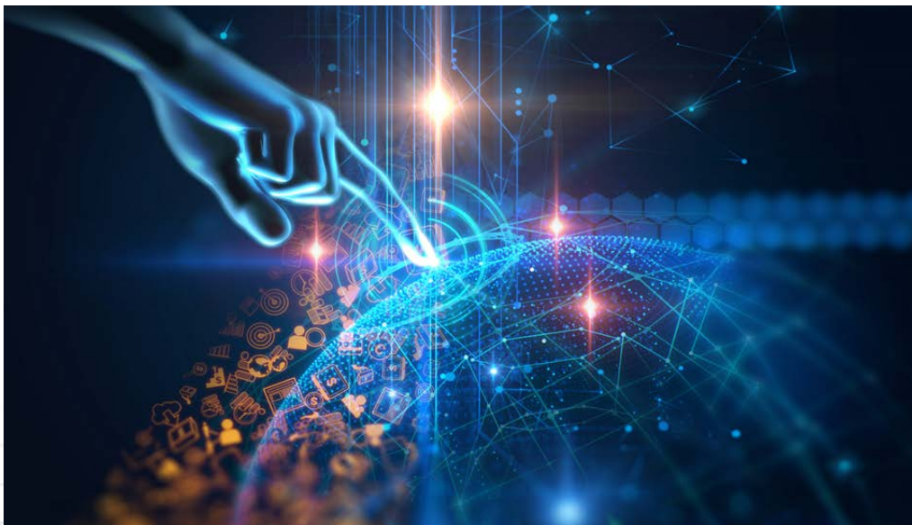
Figure 4 Sensory interconnection — fusion of all senses

Sight and hearing as well as touch, smell, and taste are essential for us to understand our world. In 2030 and beyond, the signal transmission of not only hearing and sight but also the other main senses — touch, smell, and taste — will become a major part of communications and soon be used in various fields, from healthcare to education, entertainment, traffic control, production, and social interaction. In the future, people will be able to feel the warmth of a hug from a family