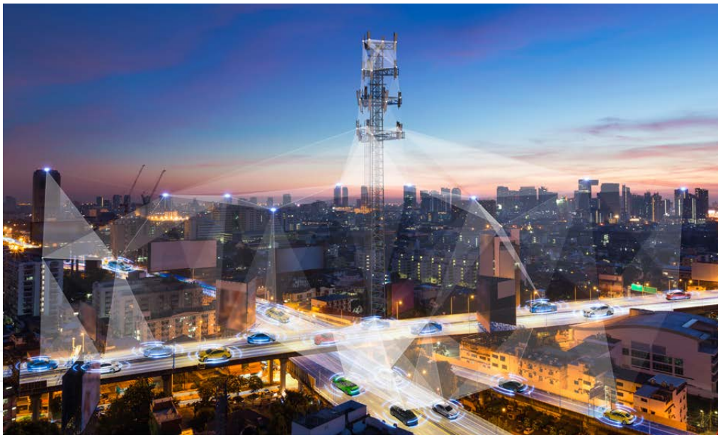
Figure 6 Communication for sensing — extending the functions of converged communications

With real-time wireless sensing, advanced signal