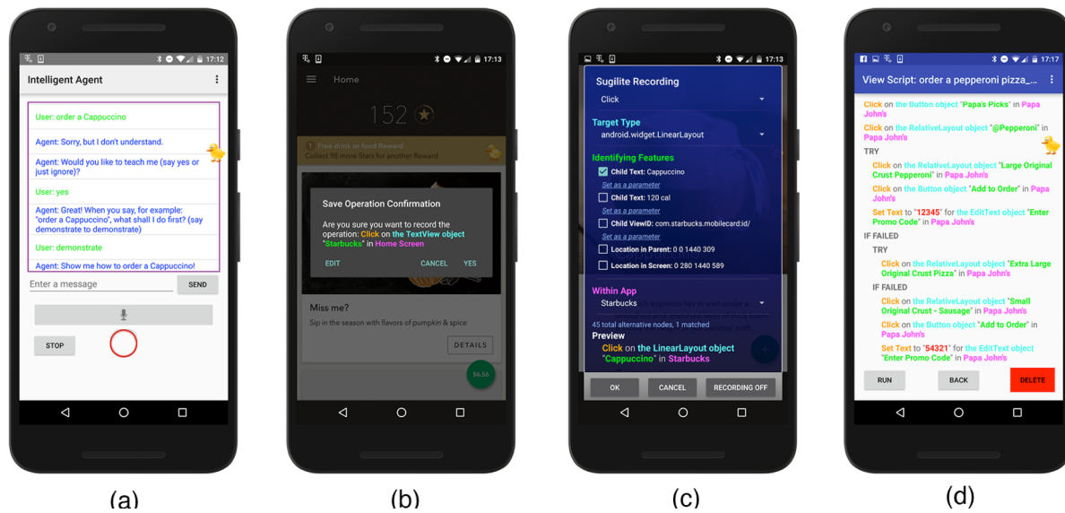
Figure 1. Screenshots of SUGILITE: (a) the conversational interface; (b) the recording confirmation popup; (c) the recording disambiguation/operation editing panel and (d) the viewing/editing script window.

Very few PBD systems exist on smartphones. KEEP DOING IT [26] derives IF-THEN automation rules from the user’s demonstration. But it can only invoke system functions like turning on Wi-Fi, setting the ringer to silent, etc. It does not have the ability to control arbitrary third-party apps on the phone like SUGILITE does. To our knowledge, SUGILITE is the first PBD system to allow the automation of arbitrary tasks on any third-party app on a smartphone.