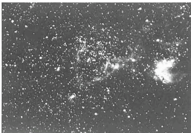
This is one of the first photographs obtained with the new Danish 1.5 m telescope on La Silla. It shows the nebula NGC 2081 in the Large Magellanic Cloud and was made with the 9 cm McMullan electronographic camera at the Cassegrain focus, on Ilford G5 emulsion behind a sky limiting filter (DSB = "Dark Sky Blue", central wavelength 4900 Å and width 800 Å). The exposure time was 30 min, and the picture shows fainter details than a similar 15 min direct photograph of the same object from the 3.6 m telescope.

The optical system is a classical Ritchey-Chrétien configuration, with a primary mirror of 154 cm diameter, primary focal ratio f/3.5 , and final focal ratio f/8.6 . The focal length is thus close to 13 m, and the plate scale 16''/\text{mm} . The usable uncorrected field is about 80 mm in diameter ( 20' ), with a