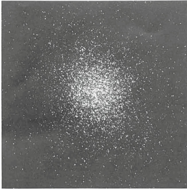
Omega Centauri, the brightest globular cluster in the sky. 10 min exposure in (Johnson) V colour. The plate was taken by S. Frandsen and B. Thomsen for the purpose of checking the electron optics, in particular the acceleration potential. There is therefore a slight elongation of the images at the edges.

An instrument adaptor with field and slit viewing optics, focusing, and autoguider; a Quantex integrating ISEC TV camera acquisition and guiding system; a small-field (80 mm) photographic camera (ESO is planning a large-field camera); 4 and 9 cm McMullan electronographic cameras with filter and shutter unit; multichannel uvby and H\beta photometers similar to those already in use at the Danish 50 cm telescope on La Silla; a two-channel (star + sky) general filter photometer; the existing Echelle Line Intensity Spectrometer (ELIS); and a fully computerized instrument-control/photon-counting/data-acquisition system for all these.