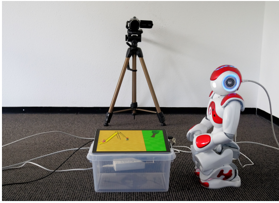
Fig. 1. The basic setup for all lessons.

autonomous social robot behaviour in a complex and dynamic environment is challenging [28], and specifically because there is no reliably performing automatic speech recognition for children’s speech [29]. The basic setup used throughout the lessons is shown in Figure 1. In this setup, the child would sit on the floor in front of the tablet (i.e., from the position where the photograph was taken). The NAO robot was placed in a 90-degree angle towards the child, so that the robot and the child had a similar frame-of-reference. A video camera placed on a tripod facing the child was used to record the interactions. A second camera was placed from the side to get a more complete overview of the interactions.