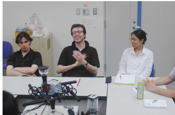
Figure 2: The device is relatively unobtrusive in actual use and does not hamper the interactions

scribing the body, hand and head movements is produced automatically.