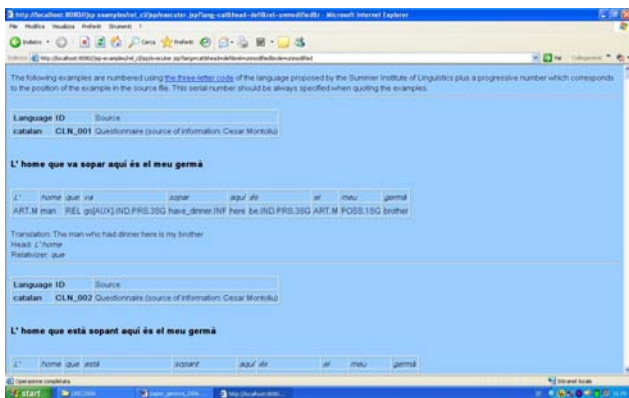
Figure 2. The output.

Once one has created his query and clicked on the ‘Send query’ button, the database will return all records which match the query. The number of records returned will obviously depend on which value one selects and/or on how specific the query is. The data are displayed on the screen as a triple, example + gloss + translation, i.e. without including any judgment or typological generalization: