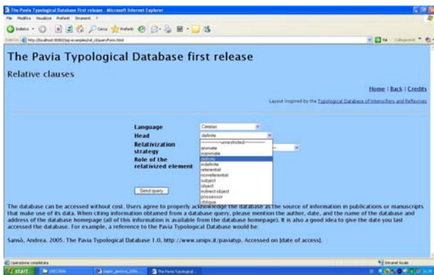
Figure 1. Selecting a language and a type of head.

By way of illustration, let us consider the first module of the database (relative clauses): it is queried by using pulldown menus for four different fields (Language, Head, Relativization strategy, and Role of the relativized element). Once the appropriate value has been chosen, clicking on the “Send query” button will output all records in the database which match the selected values. In the particular case displayed in figure 1, we will obtain all the Catalan relative clauses in which the head is definite.