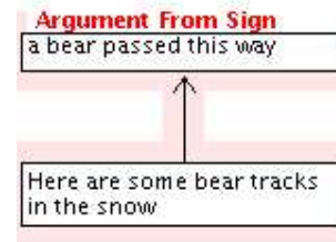
Figure 1: The AML and diagrammatic forms of a sample file distributed with Araucaria.

<?xml version="1.0" encoding="UTF-8"?> <!DOCTYPE ARG SYSTEM "argument.dtd"> <ARG> <?Araucaria UTF-8?> <TEXT>Here are some bear tracks in the snow. Therefore, a bear passed this way. </TEXT> <EDATA> <AUTHOR>null</AUTHOR> <DATE>2003-05-09</DATE> <SOURCE /> <COMMENTS /> </EDATA> <AU> <PROP identifier="B" missing="no"> <PROPTXT offset="50">a bear passed this way</PROPTXT> <INSHEME scheme= " Argument From Sign " schid="0" /> </PROP> <CA> <AU> <PROP identifier="A" missing="no"> <PROPTXT offset="0">Here are some bear tracks in the snow </PROPTXT> <INSHEME scheme= " Argument From Sign " schid="0" /> </PROP> </AU> </CA> </AU> </ARG>