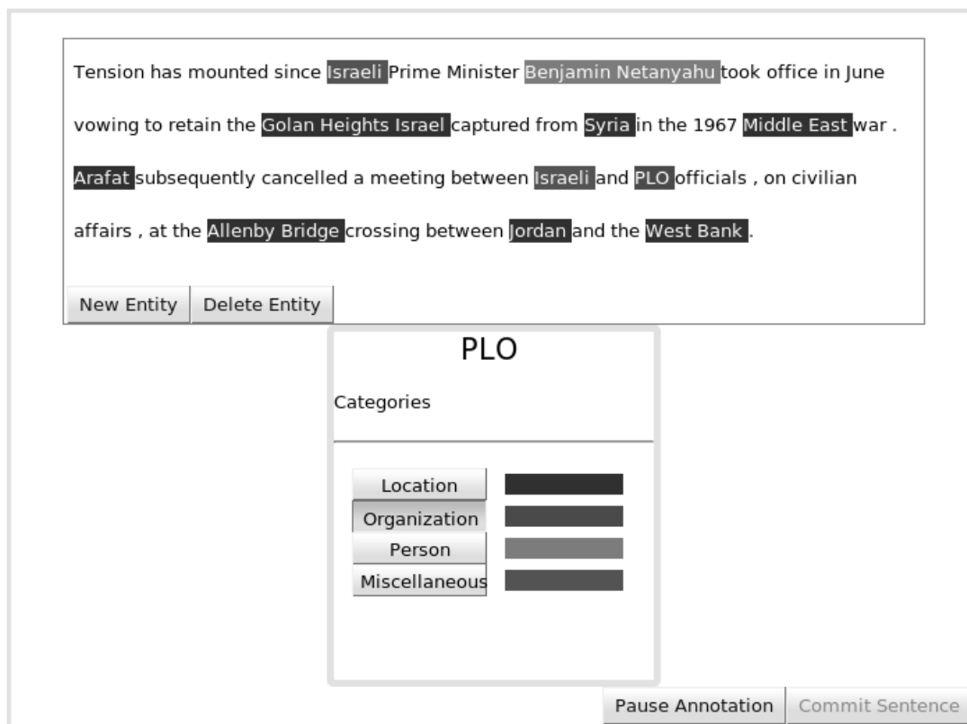
Figure 3: NER Task in CCASH