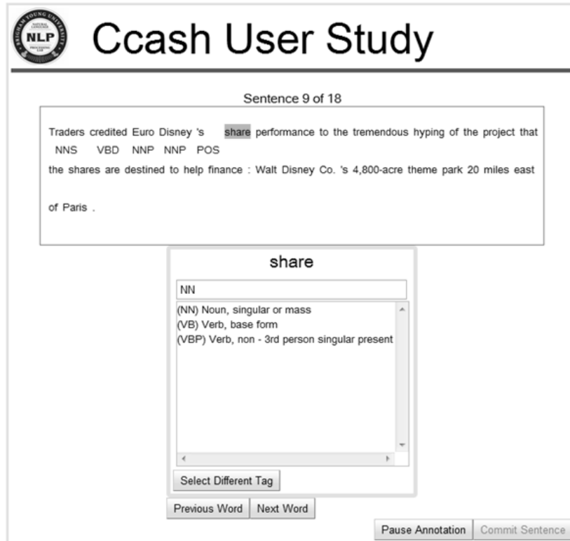
Figure 2: English POS Task in CCASH

know how to appropriately display the data instances and collect the desired annotations. The instance provider must select instances, possibly pre-label them, and then send them to the client. It receives new annotations from the client, updating its models with new annotations and recording the annotations alongside the data. The web client and the instance provider share a common method of serialization, and between those two endpoints, CCASH is ignorant of instance and annotation values. CCASH simply passes the serialized value along as a member variable of wrapper objects that CCASH uses to maintain records in its own database.