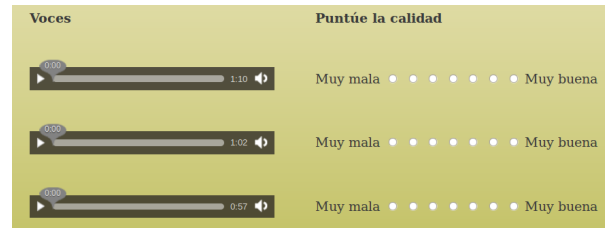
Figure 1: WEB interface for the 3rd test: quality of voices

The objective of the last test is to rate the voices both in absolute terms and relative to the other voices. In the first part of the test, the participants evaluate the male voices and, in the second part, the female voices. For each speaker, only one long audio file is presented and there is only one global question about the pleasantness: rate the quality of the voice: how much you like the voice . The revised MOS scale (R-MOS) is used: seven ratio buttons are presented and only the extreme buttons are labeled with very bad quality in the left and very good quality on the right (see Figure 1). The instructions ask the participant to make a join evaluation of the three speaker voices, listening the three audio signals as much as it is needed. The participant selection is mapped to 1–7 scale. For baseline voices, M0 and F0, the CLUNIT voices are used, as this technology produced the best results. For the other voices, the models trained with bilingual data have been used.