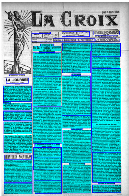
Figure 3: Block selection in a page (selected blocks are in blue, the user has deselected titles and headers).

Given a whole newspaper page, this tool links the picture of the page with its corresponding OCRred text in XML format. As outlined above, both picture and text are segmented by the OCR process into segments of various sizes (a word, a sentence, a paragraph). This tool generates separate images for each selected block and one file containing recognized text segments corresponding to each block. Initially, all text segments are selected: the user simply needs to click on irrelevant segments to deselect them. Finally, a file composed of those text segments that were kept selected (blue blocks on figure 3) is produced by this tool. Named entity annotations will be performed on this output text file.