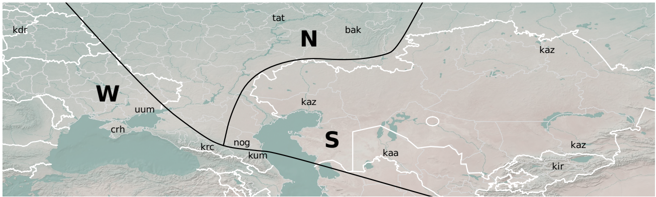
Map 1: The three sub-branches of Kypchak (North, South, West), roughly divided with black lines, showing the geographic distribution of the three languages for which transducers were developed. The Kypchak languages shown on the map are Tatar (tat), Kazakh (kaz), and Kumyk (kum). The other codes represent Bashkir (bak), Kyrgyz (kir), Karakalpak (kaa), Nogay (nog), Karachay-Balkar (krc), Urum (uum), Crimean Tatar (crh), and Karaim (kdr).