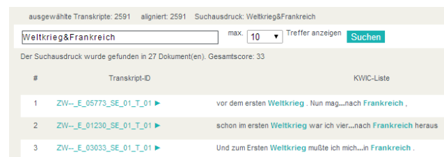
Figure 3: Full text query on transcripts

document level (for instance, for finding all transcripts which contain certain words). Because they do not make any assumptions about the internal structure of the data, full text queries also ensure a minimum level of searchability over the whole database, i.e. also over those transcripts which are only stored as unstructured text documents.