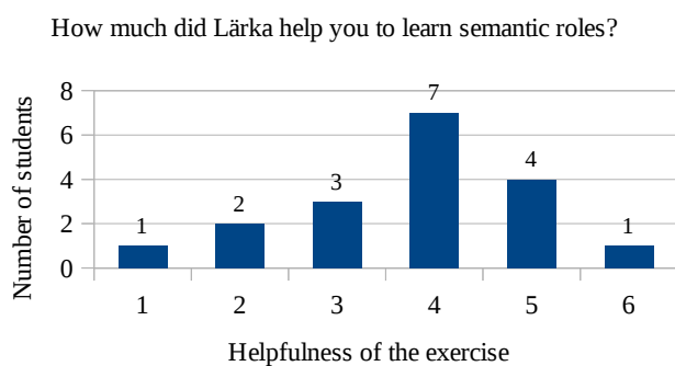
Figure 4: Results of the evaluation question for the semantic role exercise.

terms (since they are more widely known) together with a short definition, which we have already added. Besides linguists, we carried out an initial evaluation with a group of students who have used different Lärka exercises during the laboratory sessions of a university course in Linguistics. The answers for the question concerning the exercise for semantic roles is presented in Figure 4.