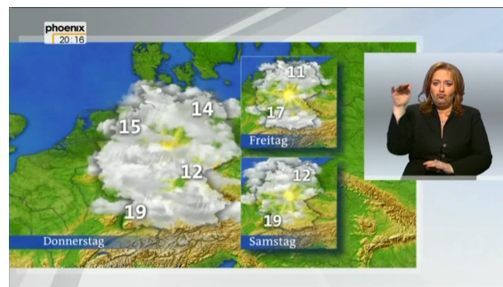
Figure 1: RWTH-PHOENIX-Weather Example of original video frame. The sign language interpreter is shown in an overlay on the right of the original video frame.